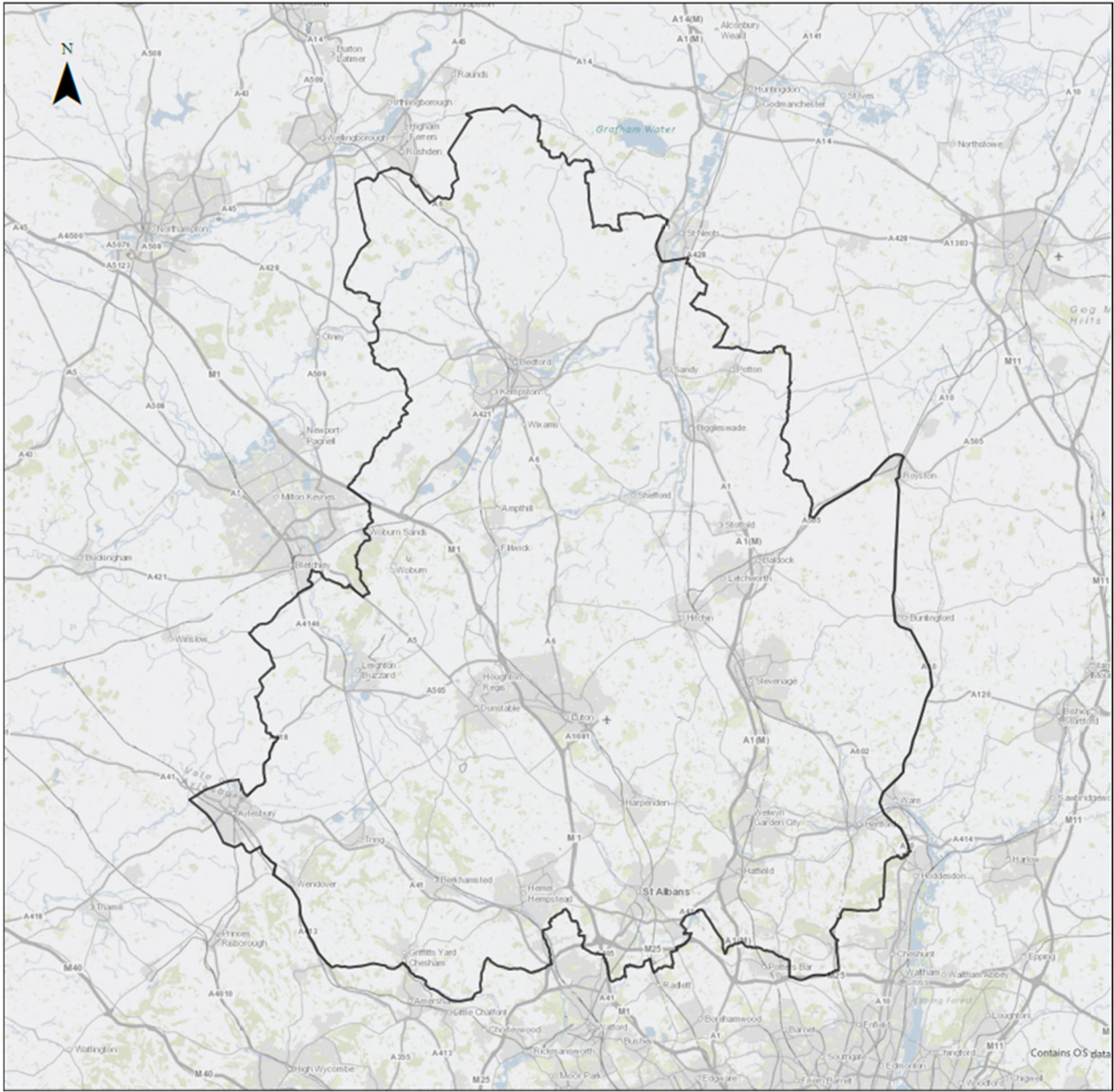
Figure 9.1: Community First zone